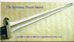
The Skofnung Nordic Sword

See the New members of the Last Legend family at www.swordarmory.com or call 888-783-7805