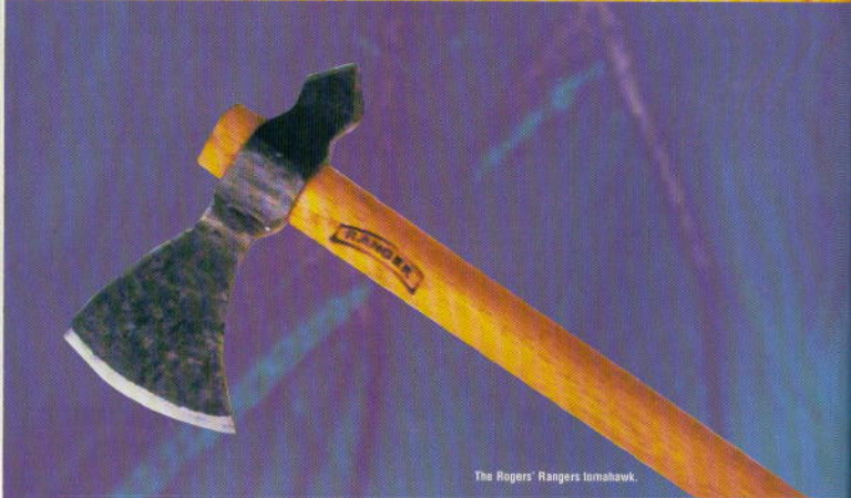
The Rogers' Rangers tomahawk.