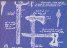
One of the designs from the Rangers depicting the Rogers' Rangers tomahawk.